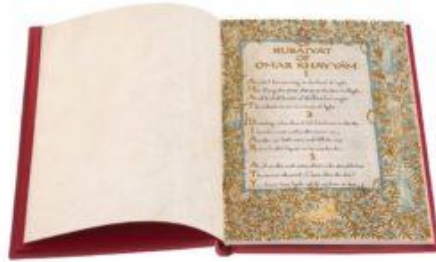
Fig. 3: Rubaiyat (1872), title page. Facsimile Folio Society 11