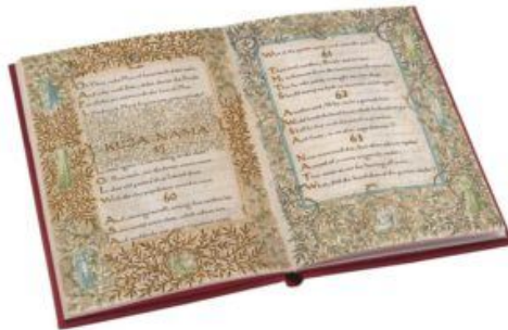
Fig. 4: Rubaiyat (1872), “Kuza Nama”. Facsimile Folio Society 12