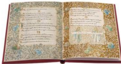
Fig. 5: Rubaiyat (1872), Last page. Facsimile Folio Society 13