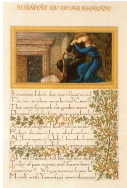
Fig. 1: Rubaiyat of Omar Khayyam, watercolor, bodycolor and gold leaf (1870). Calligraphy and ornamentation by William Morris, illustrations by Edward Burne-Jones.